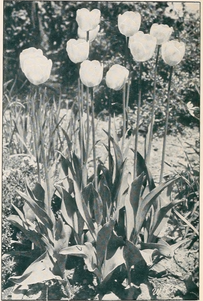
Darwin Tulip, Clara Butt